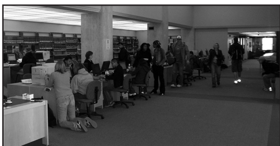
Helping students is the goal of the Rapp Challenge Grant.

are broader, deeper and more up-to-date than otherwise possible. These funds are invested and earn interest in perpetuity. The Library uses a percentage of the interest to purchase materials. The