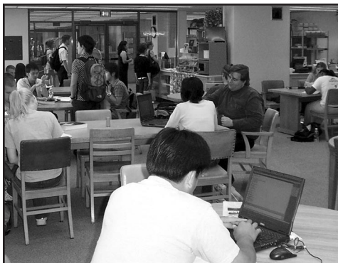
Much of the work students do is already concentrated on the first floor. The project would help provide them with the best facilities possible.

...a stimulating, responsive, and effective environment for student learning and academic achievement.